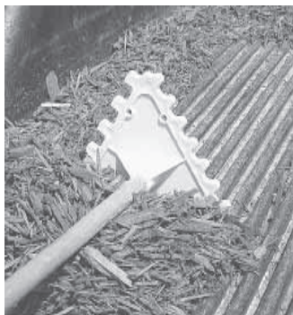
Triangle-shaped poly rake has different sized and shaped teeth on each side, making it easy to remove material from the grooves in any drop-in bedliner.

Contact: FARM SHOW Followup, Loadhandler Products Corp., 342 Fourth St., Libertyville, Ill. 60048 (ph 800 580-0791; contact@loadhandler.com; www.loadhandler.com).