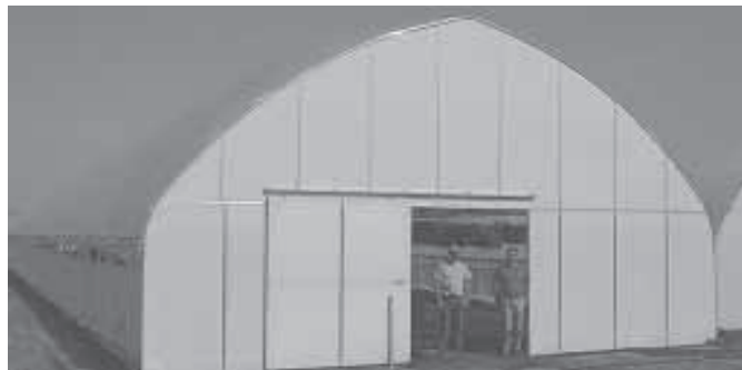
Build-it-yourself cold frames can also be used as greenhouses with heaters and fans.

Contact: FARM SHOW Followup, Dave Jones, 1185 Pine Ave., Fairfield, Iowa 52556 (ph 319 694-3684; triplej@iowatelecom.net).