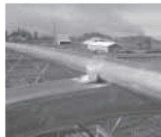
Cold frame shell is made of square tubing (left). Besides shedding snow, the arch reduces condensation build-up and water dripping inside.