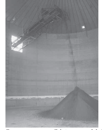
Conveyors move soil into a remodeled 50,000-bu. grain bin.