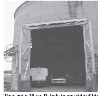
They cut a 20-sq. ft. hole in one side of bin and framed in a doorway with heavy steel trusses.

to selling out," says Mills. "After five weeks of rain, we only had about 30 yards left."