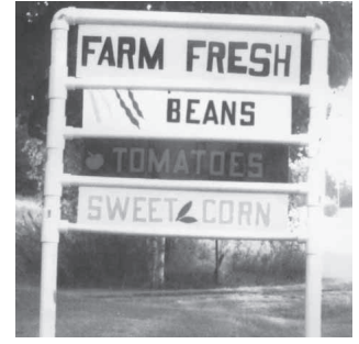
Sign is made out of 10-ft. lengths of pvc pipe, with four openings to hold foam board signs.

The legs of the sign slip over two regular steel fence posts. "It's durable and easy for me to change if I run out of something," he says. "At night I just cover the sign up with a garbage bag so people know we're closed."