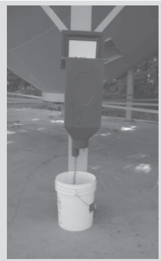
Bin holds more than a 5-gal. pail of samples. There's a whiteboard and pen under the lid to write information about the crop.