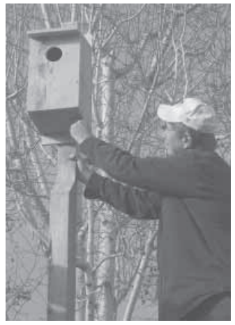
Nesting box is made from wood and is designed to mount on a pole or tree 10 to 30 ft. above the ground.

"It's a relatively inexpensive way to provide bird control. There's no 100 percent guarantee that kestrels will come, but in three years I've been building them I've had a 60 percent success rate. I got the idea from a retired state fish and wildlife biologist who told me how to build them. I had tried using sprays and bird guns, but nothing worked. It also works great for keeping birds away from feedlots. I've even sold some nesting boxes