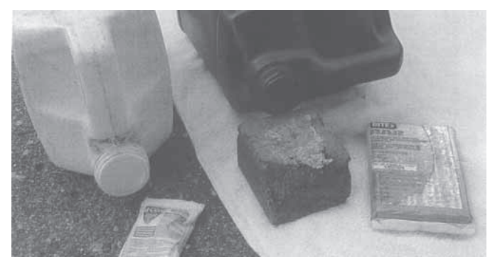
To safely kill rodents, Richard Layden removes the cap from a 2 1/2-gal. plastic jug, places sticks of D-Con inside the container, and then lays the jug on its side.

Contact: FARM SHOW Followup, Totally Tubular, 403 N. 1st St., Aberdeen, S. Dak, 57401 (ph 605 216-2102; brentw49@abe. midco.net; www.totally-tubular.net).