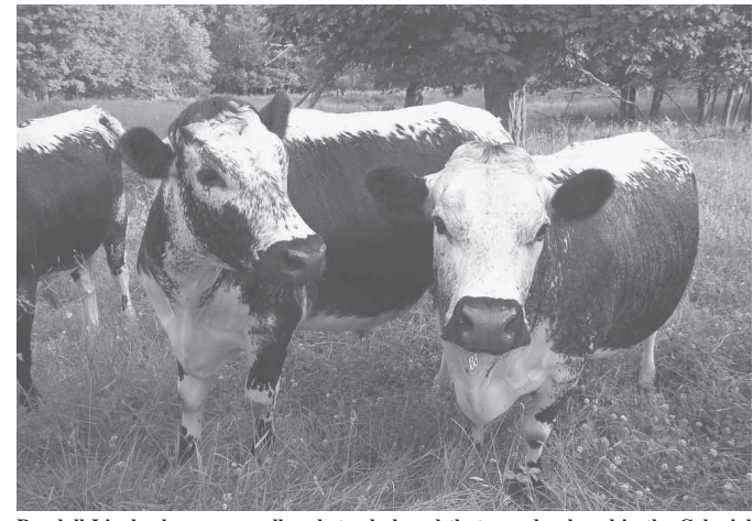
Randall Linebacks are a small and sturdy breed that was developed in the Colonial days. Now they're making a comeback.

By late 2007 or 2008, Joe Henderson hopes to be able to offer Randall Lineback stock to qualified breeders. Young bull calves for the rose veal market are currently bringing over $1,200 at market. Older breeding heif-