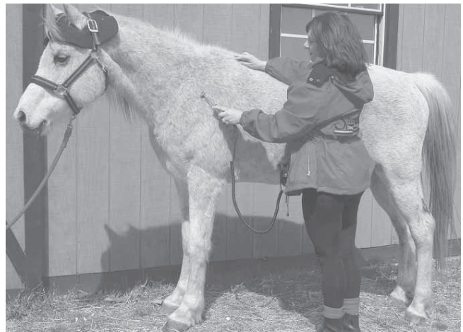
Sumerel therapy system helps find physical problems affecting a horse.