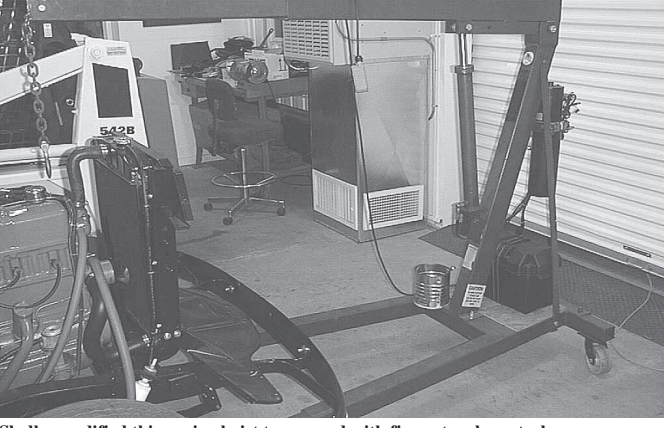
Sladky modified this engine hoist to respond with finger touch control.

Sladky made a few other modifications to the hoist, replacing the original castors with larger, heavier duty castors. The larger ball