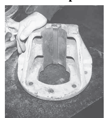
To restore worn wheel hubs to "like new" condition, Dale Denton cuts a new keyway into the wornout hub and replaces it with a new full-size key.

"My neighbor charges $50 for a refurbished wheel hub, whereas a new hub costs at least $180," says Denton. "The problem