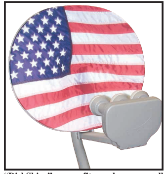
"DishSkinz" covers fit snugly over small satellite dishes. They're made from clear plastic, with an embedded image.

The company also offers custom designs for fund-raisers or company promotions (minimum order of 250 required).