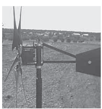
Windmill comes with six carbon blades. It sells for a fraction of the cost of giant rotors on wind forms

Blades, tails and alternators are all offered separately, and Goss suggests international buyers use the dimensions he provides to build their own tails. It is one more way he