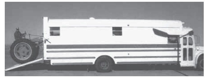
Loyal Smoke uses a converted school bus to haul three tractors to antique tractor shows, and he also stores them in it at home.