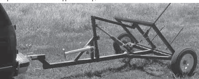
Bale hauler can be pulled by a small pickup or mini van. Bale is held at a 45 degree angle during transport.

Contact: FARM SHOW Followup, Loyal Smoke, P.O. Box 430, Limon, Colo. 80828 (ph 719 775-9543).