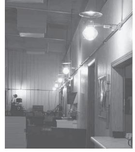
Propane-fueled lamps produce light that rivals a 100-watt bulb.

After trying a wide variety of tubes and fittings and introducing two earlier models to the market place, Schrock now has a lamp that will produce light that rivals the 100-watt bulb. It uses the Ven-