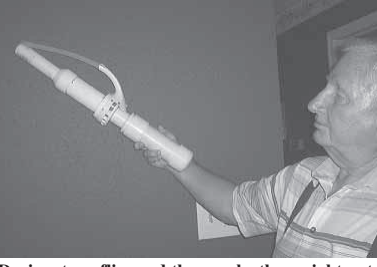
Device stuns flies and then sucks them right out

He has a working prototype and says his sanitary, easy-to-use device stuns flies and then sucks them right out of the air