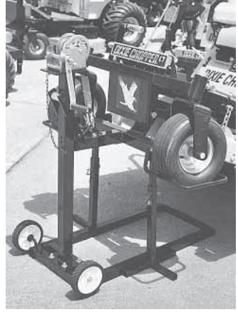
Mo-Jack's self-braking winch lifts the mower on a T-shaped lift bar that supports the front wheels.