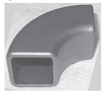
Ready-made corners provide a strong joint without losing any structural strength.