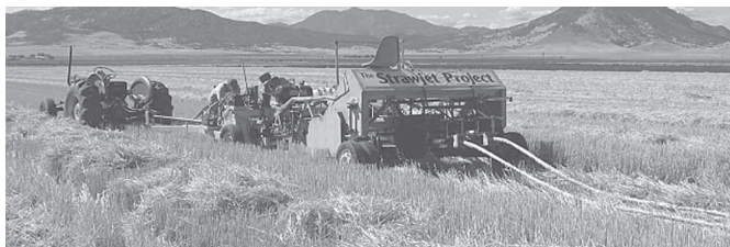
Strawjet machine makes tightly compressed, wrapped cables of straw from windrows in the field, above. Compression wheels, below left, pack the straw. Cables are “cemented” together with a clay-based adhesive and then plastered over, below right, to make beams and panels.

Strawjet cables can be joined together into virtually any thickness or length, depending on the application.