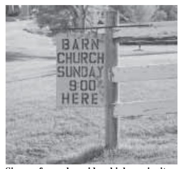
Sign on farm alongside a highway invites congregation members into barn church.

The barn sanctuary has had its highs and lows. As anyone who has ever stacked bales in a hayloft knows, it can get hot. And once autumn came, getting rid of heat wasn't a problem in the uninsulated barn. A noisy heater has been supplemented with extra layers of clothes by regular attendees. Members bring blankets and afghans for use