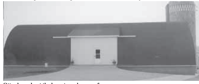
Otte cleaned out the barn to make room for pews.

Contact: FARM SHOW Followup, Tom Otte, 28937 Northfield Blvd., Randolph, Minn. 55065 (ph 507 645-4816).