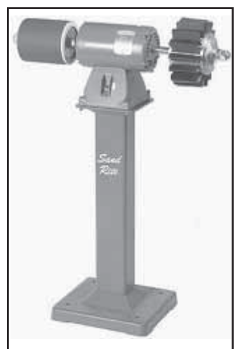
Contour sander features both a pneumatic sanding drum and a unique brush-type sanding head.

Sand-Rite's specialty is coated abrasives for their machines and others. They stock all grits from #24 to #400. They also can custom make any size belt, sleeve or roll in alu-