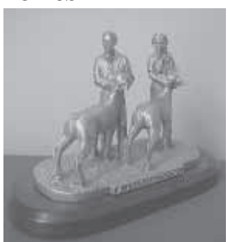
Items range in price from $5 for a small calf to $65 for several livestock show scenes.

Contact: FARM SHOW Followup, Virginia Bartges, Country Images, 6 Palm Ct.,