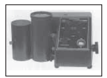
Digital upgrade for Model 919 moisture testers fits Labtronics and Motomco versions of the meter.

"There are hundreds of thousands of old Model 919's still in use," says Fraser. "We