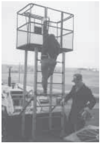
Scaffold stands about 8 ft. above the loader bucket, which means a person standing in