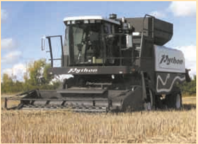
Rite Way Mfg, built 4 Pythons for sale this year. The combine replaces most belts and pulleys with individually controlled hydraulic motors.