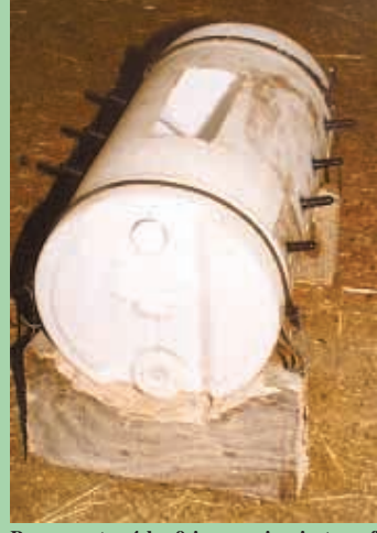
Brown cut a 4 by 9-in. opening in top of feeder. It's large enough to pour milk into, but small enough to keep lambs from jumping in.

Lyle made two of the feeders, so they have room for 16 lambs. Joyanne fills the feeders