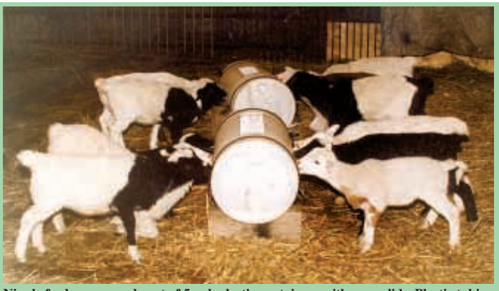
Nipple feeders are made out of 5-gal. plastic containers with screw lids. Plastic tubing runs from nipples to bottom of container, serving as straws to allow lambs to get all the milk

A variety of paddock setups are possible. Contact: FARM SHOW Followup, Pivotal Fencing Systems, LLC, 10092 County Road 36, Yuma, Colo. 80759 (ph 970 848-5500; Website: www.pivotpost.com).