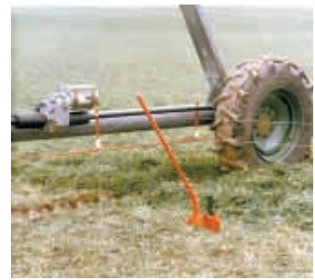
Once both pivot wheels have rolled over the wires, the post and fence spring back.