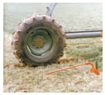
As pivot tower wheel presses on fence wire, the wire pulls post down flat on ground.