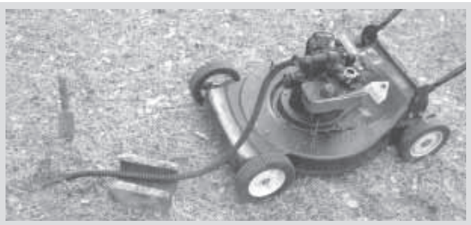
Rickard runs an old mower about 10 min. to "smoke" out moles in their tunnels. A piece of concrete under the hose keeps it from burning the grass.

Rickard flattens the tunnels, and then returns later to see which are active. Then, he pushes the hose into one of them, packs the soil around it, and runs the motor for 5 to 10 min. "I can tell if it's doing some good by the smoke coming out of the far ends of the tunnels. This will get the moles behind the walls and under flowerbeds," he says, add-