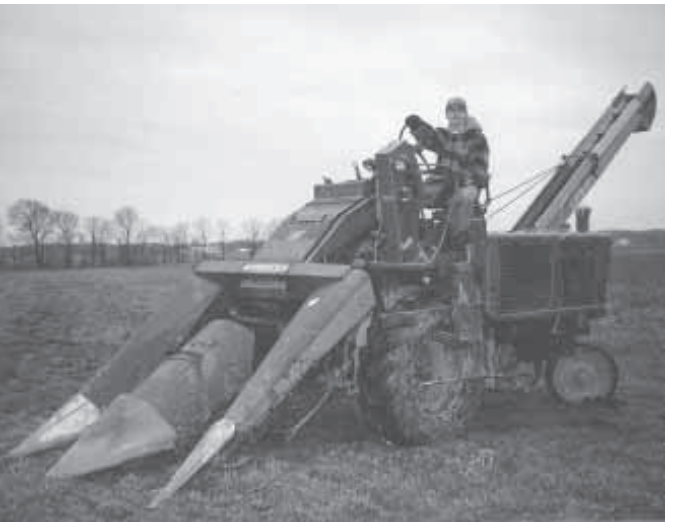
Corn picker consists of a late model 2-WD Minnesota Moline Uni-tractor's power unit, a New Idea husking bed, and an 83 Oliver 2-row picker snapping head.

Contact: FARM SHOW Followup, Robert Breyley, 11007 New London E., Spencer, Ohio 44275 (ph 330 667-2472).