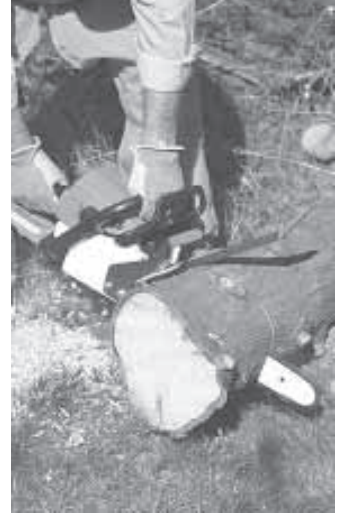
Guard doesn't prevent kickback but protects the operator from injury.

With a slight tug on the handle, the steel guard pulls up for undercutting or tightening the chain.