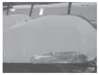
Stainless steel wear strips fit onto combine's hood and snout.

Contact: FARM SHOW Followup, Clarke Machine, Box 694, East Hwy. 34, Howard, S. Dak. 57349 (ph 605 772-4164; email: