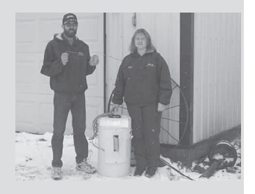
Ertlizer uses 110-volt current to gather stray voltage. A conducting rod buried beneath the unit focuses it away from the area where the unit is placed.

"Any motor that sits horizontal with the ground will send out electromagnetic fields