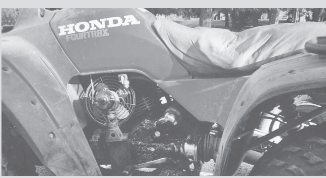
"It lets me operate the ATV at idle all day long without ever overheating the engine," says Doug Fluit. "I've put hundreds of hours on my ATV since I added the fan, with no problems. I think the same idea could be used on any ATV equipped with a 12-volt hattery."

Louis Trepainer, Ontario: "To add more life to your deep cell battery when out trolling in a fishing boat with a DC-powered motor, just hook up a 5-watt solar panel to the battery posts and you'll be able to stay out a lot longer."