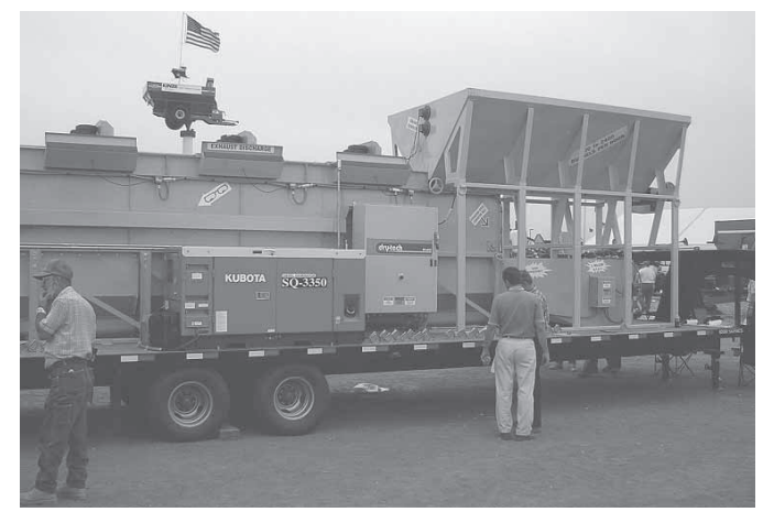
"With LP at $1.28 per gallon, our costs, including electricity, run between 1.2¢ and 1.3¢ per bushel per point," says Brad Ross. "Most people tell us that grain drying in a conventional dryer costs between 2¢ and 5¢ per bushel per point.

An added advantage of the compact design is portability. DryTech is offering three variations on their units. A permanent, stationary