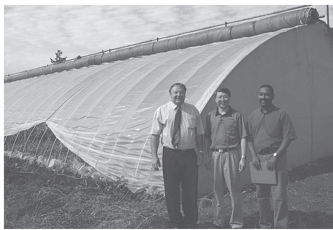
Each greenhouse cost about $14,000 to build. The special building materials were shipped from China. A Chinese technician provided expertise.

Contact: FARM SHOW Followup, Wenkai Liu, 45 Main St., Elie, Manitoba, Canada ROH 0H0 (ph 204 353-4088; kaiwenlius @hotmail.com).