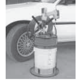
Able Oil Changer is designed to pump out used oil and refill the engine in just a few minutes. You can use any reversible power drill to power the pump.

"I'd be happy to advise anyone on how to