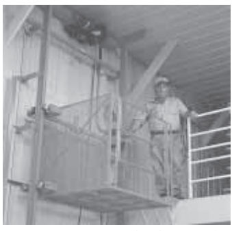
Elevator goes up to shop's loft area, which is used to store small parts.