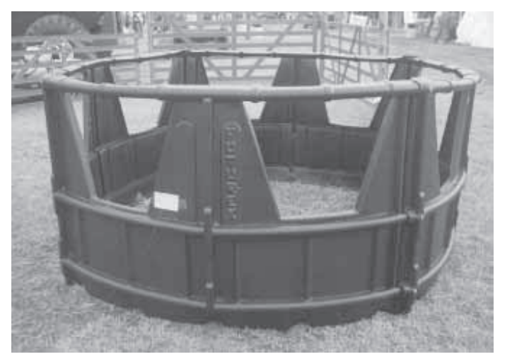
Poly hay ring is flexible and won't break even in extreme weather conditions, says the manufacturer.

Contact: FARM SHOW Followup, Hurricane Industries, 21432 Old Yale Rd., Langley, B.C. V3A 4N7 Canada (ph toll free 877 888-1233; Website: www.hurricanindustries.com).