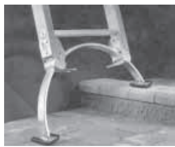
Stabilizing arch is fitted with rubber-treaded feet. When you set ladder on steps or uneven ground, the ladder self levels on arch.

Rd., Gravel Switch, Ky. 40328 (ph 270 692-6024).