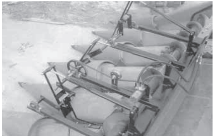
Header sweep assembly is powered by a hydraulic motor that attaches to combine's reel drive. It has fingers that straddle the center three snouts in a row crop header.