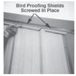
Bird-proofing shields screw in place over ventilation gaps between sidewalls and roof.

He's currently looking for someone to make the shields for him and anticipates they'll be available through home and building supply retailers in the not-too-distant future. "We'll be making them in sizes to fit the corrugations on steel or galvanized siding, so prices will vary according to size," he says. He figures they'll be more than worth the cost, which he estimates at under $2 per foot of building width. "They add more trim to the building and make it look nicer. And bird proofing should add a little value to the building, as well."