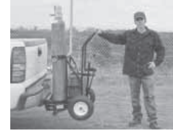
Two-wheeled cart mounts on receiver hitch, making it easy to transport without having to lift it into pickup.

Contact: FARM SHOW Followup, 2624 El Camino Real N., Prunedale, Calif. 93907 (ph 831 663-2700 or 888 436-4600; fax 831 663-2600; Website: www.stoutsmartkart. com).