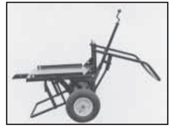
Built-in jack raises or lowers tongue and platform so you don't have to lift cart to hook up.