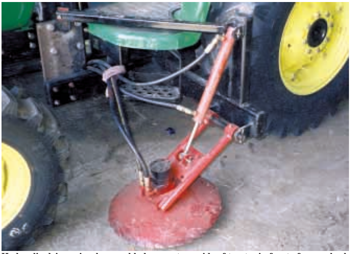
Hydraulic-driven circular saw blade mounts on side of tractor in front of rear wheel. Gengler made the saw blade himself from a 20-in. coulter.

from anything else on the market that he's applied for a patent on it.