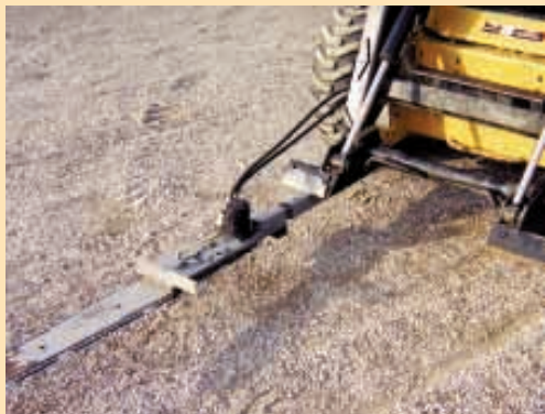
Unit's 34-in. saw bar is driven by a hydraulic motor that mounts on a short length of steel ubing. Chainsaw bar can be mounted in either a vertical or horizontal position.

To run the saw, he merely hooks the hoses