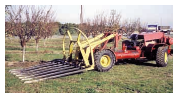
Vereschagin's brush-handling machine started out as a 1980 32-ft, diesel-powered motor home that he picked up at a wrecking vard.

"We made brush forks 8 ft. long and 9 ft. wide from 2 1/2-in. square tubing The two lift cylinders are 3 by 24 in. and the tilt cylinders 2 by 30 in. They're powered by a beltdriven pump off the crankshaft. With the forks level, it will lift 7 ft. high for stacking brush on top of another pile or setting on the burn pile. Lift capacity is only limited by the weight of the machine on the steering axle. I