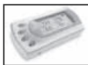
Edge Power Module

Latest new development is an adjustable power module for Ford Powerstroke engines that lets you select the amount of power you want to add on-the-go, in increments of 20 hp at a time.