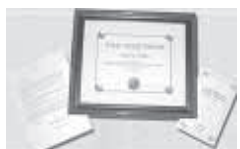
Buyers receive deed to 1 sq. in. of Texas ranchland.