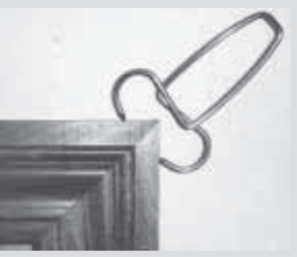
Spring-loaded clamps have sharp points that grip the wood firmly without cutting wood fibers.

ft. wide, 14-in. deep U-shaped length of conduit that U-bolts to the top of the ladder. A crutch tip is affixed to each end. Another length of conduit is bent into a "P" shape and serves as a handhold on one side of the ladder. The leg of the "P" bolts to the ladder.