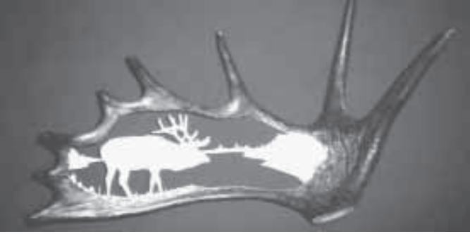
Moose antler carvings can be hung on the wall or stood on a table.

Contact: FARM SHOW Followup, Graeme MacKendrick, Box 193, Balmoral, Manitoba, Canada ROC OHO (ph 204 467-9127; email: ghmtam@mb.sympatico.ca).