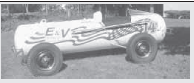
We spotted these dressed-up LP tanks this summer at the Empire Farm Days near Seneca, N.Y. They're the handiwork of employees at E&V Energy Company in Cortland and Geneva, NY. You can get more information on the company at www.fingerlakes1.com/display/ev.