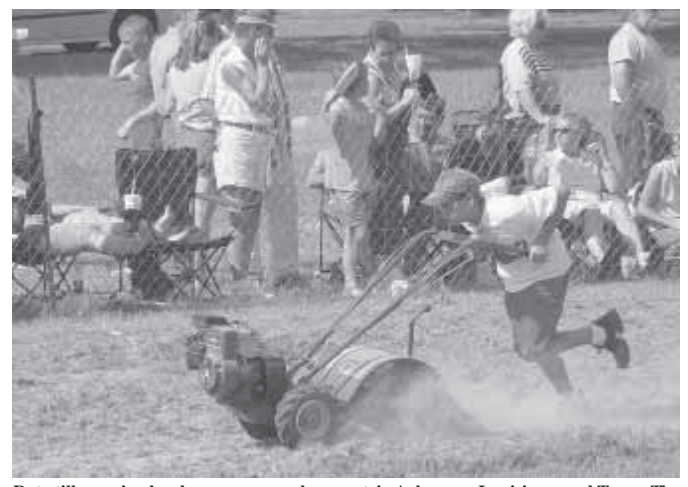
Roto tiller racing has become a popular sport in Arkansas, Louisiana, and Texas. The machines can reach speeds of more than 22\ mph .