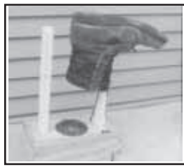
Boot dryer consists of a small wooden box with fan in the middle. Fan draws air into box and forces it up through a pair of PVC pipes.