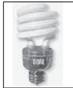
Coating on light bulb purifies air.

Contact: FARM SHOW Followup, O-ZoneLite, 1525 NW 3rd Street, Suite 9, Deerfield Beach, Fla. 33442 (ph 800 494-8292 or 954 571-1922 email: info@ozonelite.com; website: www.ozonelite.com).