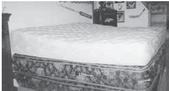
Inclined mattress is 6 in. thicker at one end (at left in photo).

Contact: FARM SHOW Followup, David E. Meyer, 6247 Crows Mill Lane, Springfield, Ill. 62770 (ph 217 585-8118).