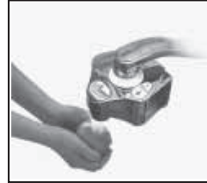
Automatic faucet has a computer chip that senses motion, automatically turning the water on and off.

Contact: FARM SHOW Followup, iTouchless Housewares & Products, Inc., 550 Pilgrim Dr., Unit I, Foster City, Calif. 94404 (ph 800 660-7978 or 650 578-0578; website: www.ezfaucet.com).