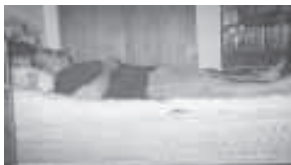
Torrez makes sloped mattresses of almost any size, even for infants (left). Foldup travel mattress is also available (right).