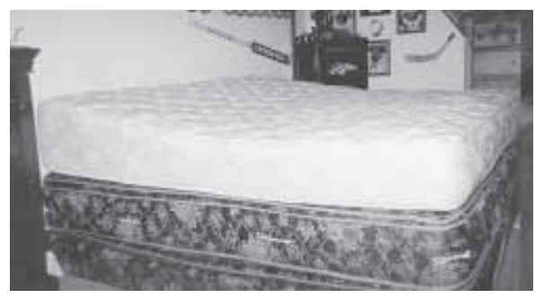
Inclined mattress is 6 in. thicker at one end (at left in photo).

Contact: FARM SHOW Followup, David E. Meyer, 6247 Crows Mill Lane, Springfield, Ill. 62707 (ph 217 585-8118).