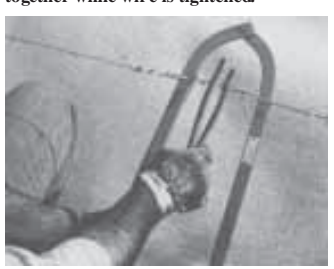
"You can make a repair in a minute without loosening staples or tie wires;" says Ken Evans.

"You can make the repair in a minute without loosening staples or tie wires," says Evans. "If the wire is still a little slack, just go down the fence a few yards and tighten it again."