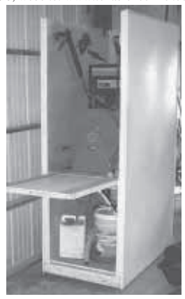
Cabinet mounts on four canister wheels and stands 8 ft. high. Front side of bottom compartment doubles as a folding shelf that folds out at pickup bed height.

Contact: FARM SHOW Followup, Texas Fence Fixer, P.O. Box 510, Seguin, Texas 78156 (ph 830 379-7344 or toll free: 866 882-2896; website: www.texasfencefixer.com).