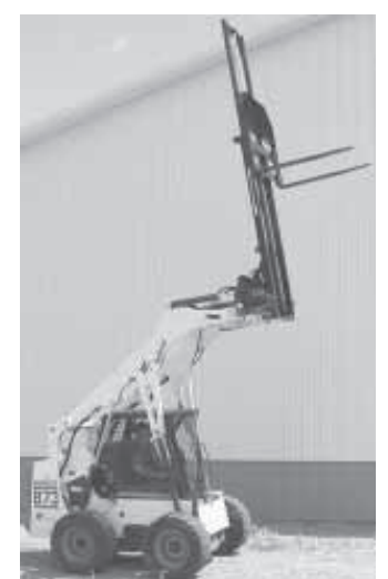
Tele-Fork quick-taches to skid loaders or compact tractors with quick-tach loader systems.

Contact: FARM SHOW Followup, Sheyenne Tooling & Mfg. PO. Box 647, 701 Lenham Ave. SW, Cooperstown, N. Dak. 58425 (ph 800 797-1883 or 701 797-2700; www.sheyennemfg.com).