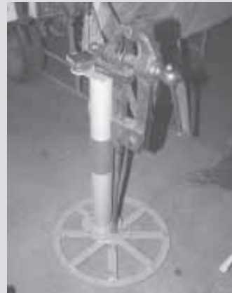
Paul Tierney, Bloomington, Minn.: "This leg vise is one of the handiest tools in my shop. I mounted it on top of a pipe that stands on a round disc I made out of metal strapping. It rolls easily around the shop to wherever I

than to hold the bolt in place until I can get a nut started. The nice thing about this idea is that you can bend the wire around obstacles as needed. If necessary, you can file the wire on the hook flat to to work better on bolt heads and carriage bolt shanks."