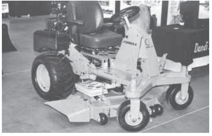
Two steerable caster wheels on front are linked to hydraulic motors on back. As wheels are cranked in either direction, power is adjusted to make a smooth turn. Front wheels have enough traction to handle hills.

Huncilman says the new mower is built heavy. "We wanted to build a Cadillac, not a Hyundai. The mower has an extra-heavy welded mower deck and reinforced frame. The entire unit is undercoated with an automotive E-coat primer. It has a comfortable padded steering wheel and a thick-back sus-