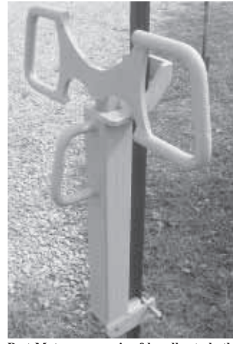
Post-Mate uses a pair of handles to both pound the post and also pull it out.

Contact: FARM SHOW Followup, Specialty Converting and Supply, Inc., Box 913, 1114 E. Marion Ave., Nashville, Ga. 31639 (ph 80 524-7567; fax 229 686-7751; email: scsinc@alltel.com_website: www.scsincorporated.com).