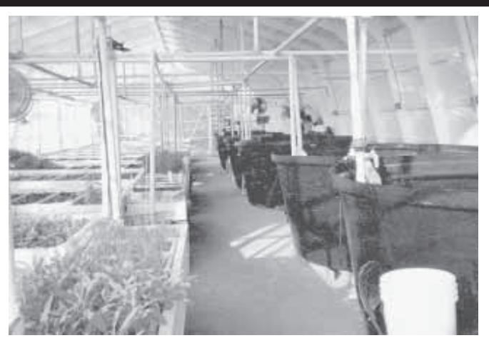
S & S Aqua Farms sells both fish and plants. Fish tank water (at right in photo) is filtered through hydroponic growing beds (at left), providing nutrients for high-value organic produce.

"We have grown over 400 different kinds of plants, everything from strawberries to dwarf bananas and dwarf New Guinea im-