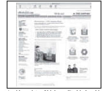
A wide variety of high-quality bir dseed is available on a new website called eBirdseed.com.

Ecker will eventually produce millet and other grains used in the various