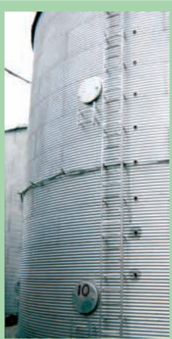
Barth put a window in every ring in each of his 10 bins. They're next to the ladders so they're easy to clean.

Contact: FARM SHOW Followup, B&B Farms, 356 Hope Rd., Enon Valley, Penn. 16120 (ph 724 336-5120; email: sd_barth@hotmail.com)