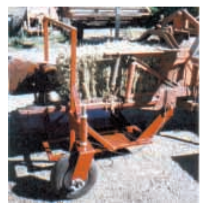
Tag-along bale scale rides on two small wheels directly behind bale chamber In-cab monitor, above,

Contact: FARM SHOW Followup, HayWeigh Systems, 7714 S. Hwy. 33, Gustine, Calif. 95322 (ph 209 854-1533 or 209 324-0754; email: HayWeigh@aol.