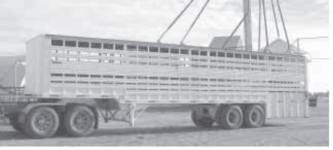
The Keltys split a 1968 double decker cattle trailer into two single deck trailers. "We sold one and use this one to move cattle to and from pasture and to market," they say.

Contact: FARM SHOW Followup, Jim Burton, JWB Marketing LLC, 2308 Raven Trail, West Columbia, S.C. 29169 (ph 800 555-9634; website: www.birdcontrol supplies.com).