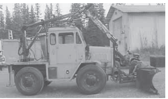
Cameron Gackstetter mounted a 10-ft. wide snow blade on front of this airplane tug.