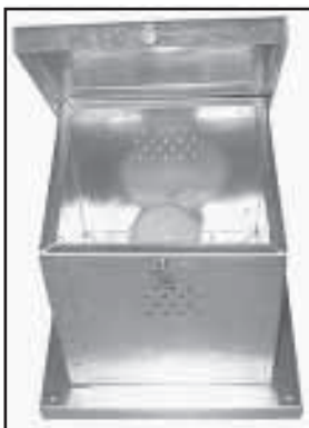
A light bulb inside metal box keeps pets warm.

Contact: FARM SHOW Followup, Akoma Dog Products, 16848 239th Ave., Big Lake, Minn. 55309 (ph 763 263-3669; email: mhill@connections-etc.net; website: www.houndheater.com).