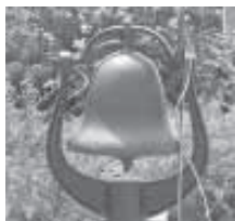
Berry Hill offers a variety of cast iron dinner bells, including this locomotive bell.

Contact: FARM SHOW Followup, Berry Hill Limited, 75 Burwell Rd., St. Thomas, Ontario, Canada N5P 3R5 (ph 519 631-0480 or 800 668-3072; email: info@BerryHillLimited.com; website: www.berryhilllimited.com).