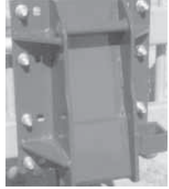
Quick-tach bracket attaches to any tractor or skid steer.

Contact: FARM SHOW Followup, AgCore, Inc., 5682 Ike Dixon Road, Camillus, New York 13031 (ph 315 672-3698).