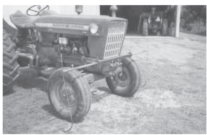
Rods at ends of crossbar are fitted with lengths of rubber tubing that follow the row.