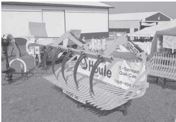
At a recent show, new detachable grapple was mounted on a rock bucket.

Contact: FARM SHOW Followup, Roy Monzo, 1620 E. Grass Lake Rd., Clare, Michigan 48617 (ph 989 386-9910).