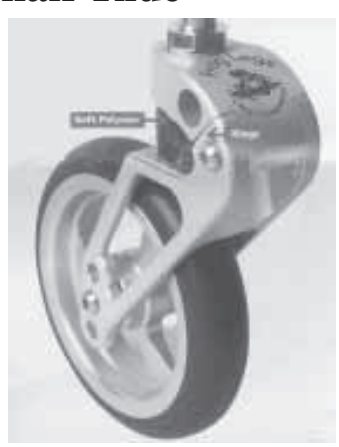
"Frog Legs" shock absorbers replace the castor forks on the small front wheels on wheelchairs.

The four models of Frog Legs shock absorbers are priced as follows: Flex Forx (designed for institutional-type chairs) - $129; Frog Legs Classics - $299; Ultra Sports - $329; and Bull Frogs Power Chair Shocks - $399.