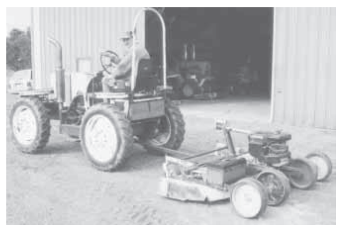
Marshall Litchfield converted an old detasseling machine into a small, 4-WD hydrostatic drive tractor. It's shown here pulling a big home-built lawn mower.