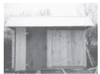
With revolving door closed, building looks like a regular shed.

"I think the same idea could be used inside a barn with an alleyway, or any other place where you keep your tack or other products. For example, a plumber/electrician told me he might use this same idea on one side of his shop. A revolving door would allow him to put whatever he needed for a job in