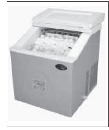
You can make your own ice right on location with this portable, self-contained ice cube maker.

"It's well made and weighs only 44 lbs. so it's relatively easy to move around," says Baerwitz. "Once the basket is full the unit automatically shuts off. It also shuts off au-