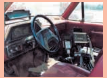
Boom nozzles are regulated by a Tee Jet 844 controller that mounts in the cab.

"I'm happy I built it and have had virtu-