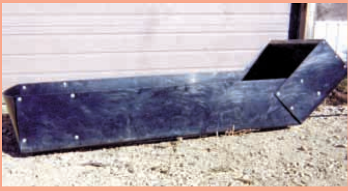
Roy Klindt used a 4 by 8 sheet of heavy duty plastic to make this 6-ft. long calf sled.

Contact: FARM SHOW Followup, Roy Klindt, Box 154, Crane Valley, Sask., Canada SOH 1B0 (ph 306 475-2225).