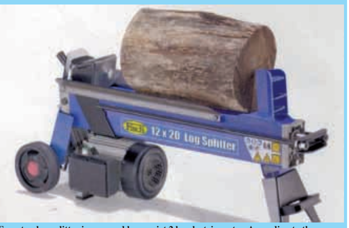
Four-ton log splitter is powered by a quiet 2 hp electric motor. According to the manufacturer, it'll split logs 20 in. long by 12 in. in diameter.

Precision Tools, Inc., Claysville, Penn. 15323 (ph 724 663-9072; fax 724 663-9065; Website: www.fisch-woodworking.com).