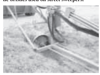
An orbit motor rotates the brush as it slides into culvert. Six 6-ft. extensions can be added to brush for a total reach of 40 ft.

Contact: FARM SHOW Followup, Les Van Ornum, Van-Boh Manufacturing, Hortonville, Wis. 54994 (ph 920 779-9999; E-mail: vanboh@vbe.com; Website: www.vanboh.com)