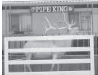
Each heavy-duty fence rail weighs 45 lbs.

Arges says all his stock is primer coated. A 9 ft. section with a post and three rails sells