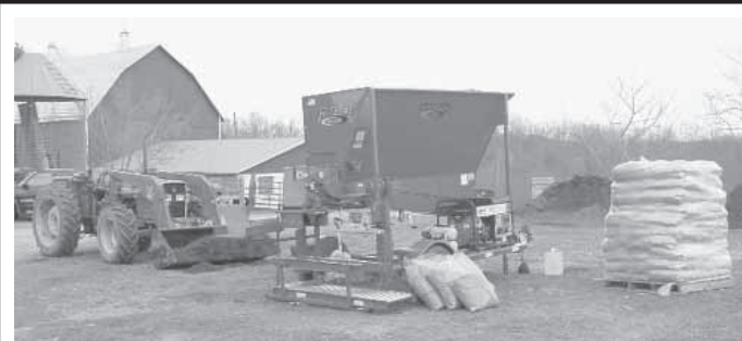
Portable Go-Bagger can fill about 240 2-cu. ft. bags per hour. It'll bag compost, mulch, soil, sand, corn, beans or almost anything else.

Contact: FARM SHOW Followup, Tim Reinford, W3494 Chicago Road, Redgranite, Wis. 54970 (ph 920 566-0389).