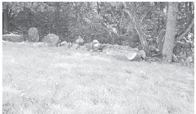
Want a grass that doesn't grow much? "No Mow" lawn mix is a specially designed blend of six slow-growing fine fescue turf grasses. It normally grows to about 3 1/2 in. high.

Contact: FARM SHOW Followup, Rotochopper, 217 West Street, St. Martin, Minn. 56376 (ph 320 548-3586; email: info@rotochopper.com; website: www.rotochopper.com).