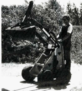
Stand-up loader can handle a load of 506 lbs. and moves along at 3 mph.

"The loader comes to a complete stop when the operator lets go of the controls so there's no danger should the operator fall off the operator platform. Because he's standing up, he