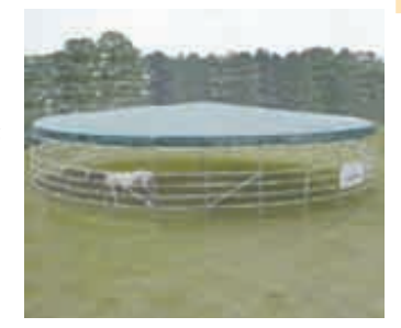
Build-it-yourself, 50-ft. dia. covered riding ring bolts together quickly and costs less than $3,000

Contact: FARM SHOW Followup, Atlas Systems, Inc., Box 558, Hwy 82 East,