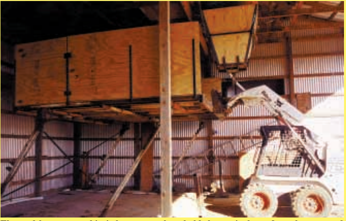
Elevated hay storage bin is large enough to hold the equivalent of two large round