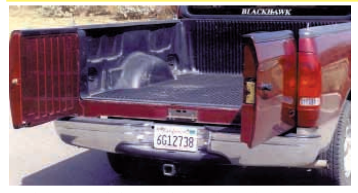
Two-piece "double door" tailgate opens from both sides, making it easy to load items onto bed.