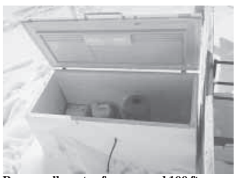
Pump pulls water from a pond 100 ft. away and pumps it to a 6-ft. long Ritchie stock waterer.

S0N 1A0 (ph 306 672-3462 or 306 672-3721).