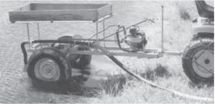
Charles Hoyt uses this trailer-mounted pump to pull water out of a nearby pond.

S0N 1A0 (ph 306 672-3462 or 306 672-3721).